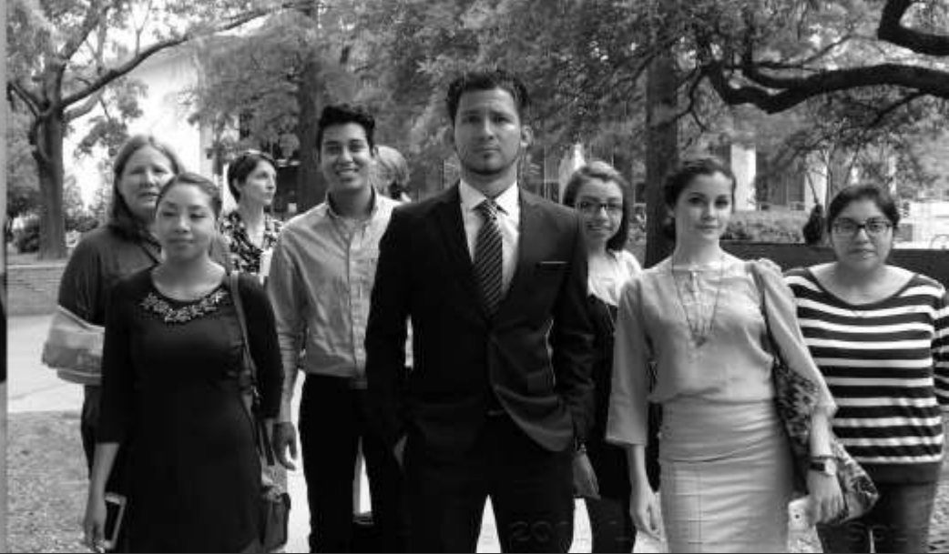
Freedom University, Georgia, 2014